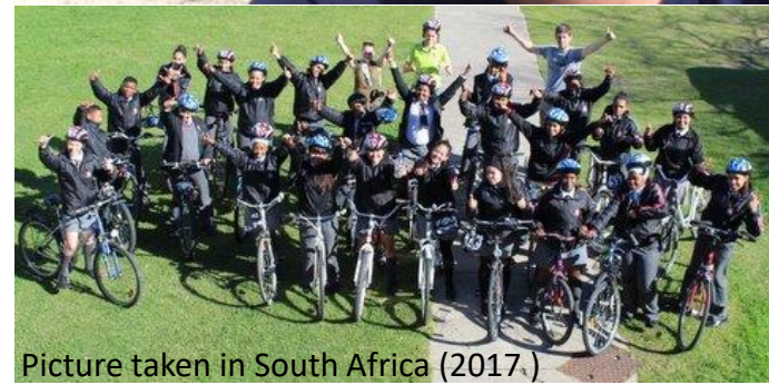
Picture taken in South Africa (2017.)

We will receive pictures of kids and youngsters happy of the donation, once the bikes will have been distributed in South Africa.