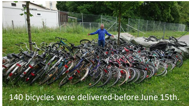
140 bicycles were delivered before June 15th.

Special thanks to our partners and sponsors: