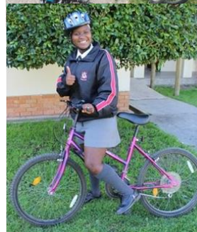
Left picture was taken in South Africa after the 2017 collection of our Club