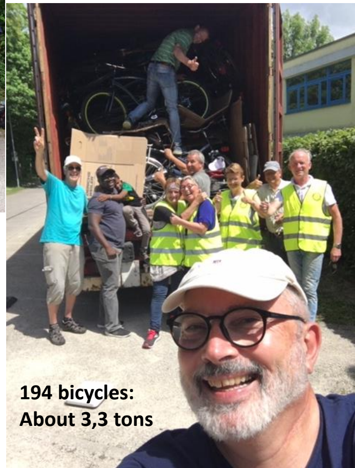
194 bicycles: About 3,3 tons