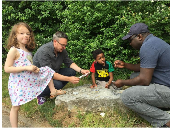
Upper picture: Strategic discussions 😊